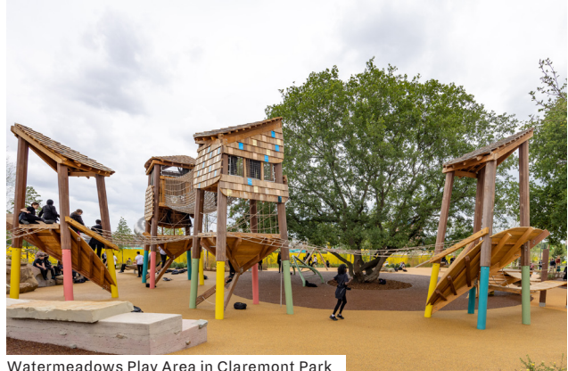
Watermeadows Play Area in Claremont Park