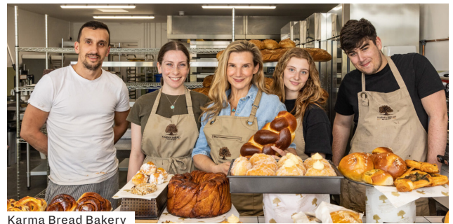
Karma Bread Bakery

Visit: www.brentcrosstown.co.uk/karma-bread-bakehouse