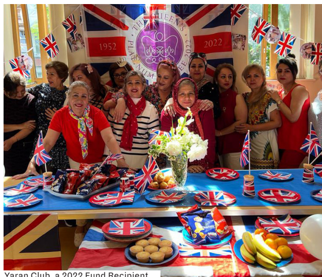
Yaran Club, a 2022 Fund Recipient

Brent Cross Town Community Fund is a grant fund supporting community initiatives in the area surrounding the Brent Cross Town development. In the past three years, it has given £90,000 to community initiatives, supported 31 community projects and directly benefit an estimated 11,500+ people.