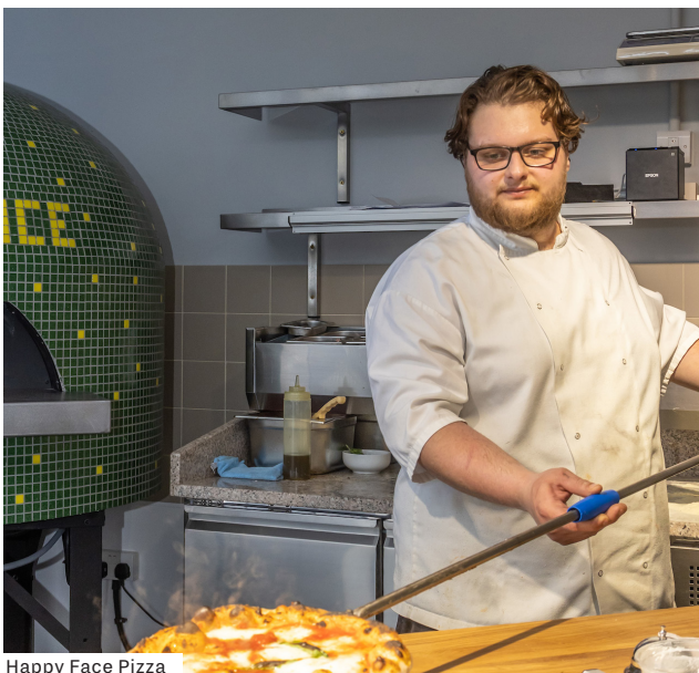
Happy Face Pizza

Visit: www.brentcrosstown.co.uk/happy-face-pizza