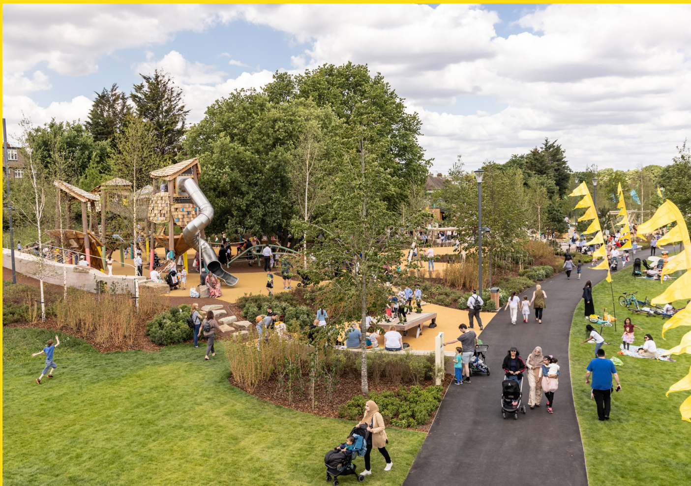
The launch of Claremont Park, June 2022