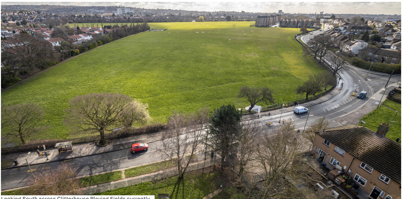
Looking South across Clitterhouse Playing Fields currently