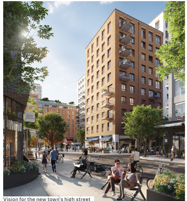
Vision for the new town's high street