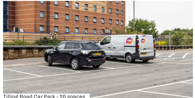
Tilling Road Car Park - 20 spaces

Please go to: bxt.uk/parking for more information.