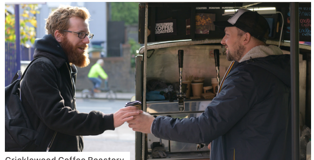
Cricklewood Coffee Roastery

Visit: www.brentcrosstown.co.uk/cricklewood-coffee-roastery for information on Cricklewood Coffee Roastery.