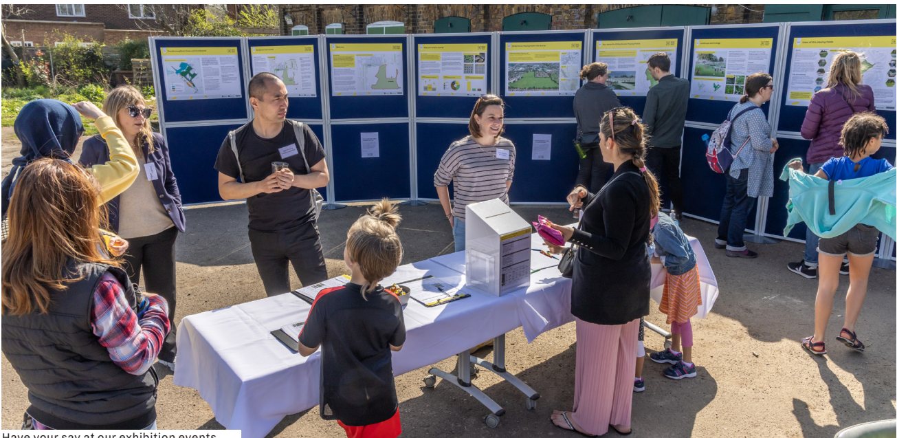
Have your say at our exhibition events

We would encourage you to attend and provide your feedback on our plans.