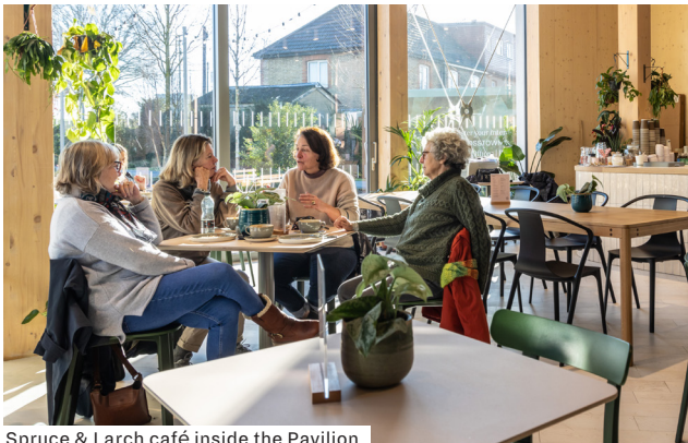
Spruce & Larch café inside the Pavilion

Visit: www.brentcrosstown.co.uk/spruce-and-larch