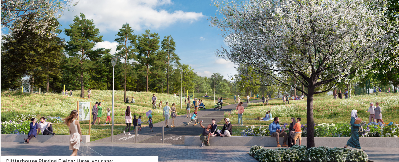
Clitterhouse Playing Fields: Have your say

Our third and final round of consultation for Clitterhouse Playing Fields is going live shortly for feedback and we want to hear from you! From Friday 9 September to Wednesday 28 September, we will be consulting with the community on our latest plans for the developed designs for Clitterhouse Playing Fields.