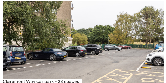
Claremont Way car park - 23 spaces