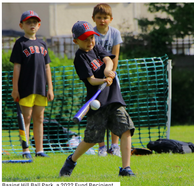
Basing Hill Ball Park, a 2022 Fund Recipient

11. The Boys Clubhouse: This group offers support to boys and young men from the Jewish community who experience poor mental health and other circumstances. Their gym and keep-fit project offer a free and welcoming venue to 40 participants a week where they can be supported by counsellors and mentors.