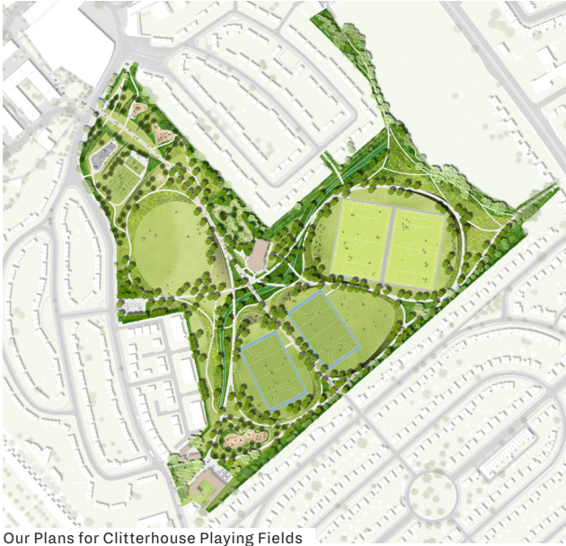
Our Plans for Clitterhouse Playing Fields