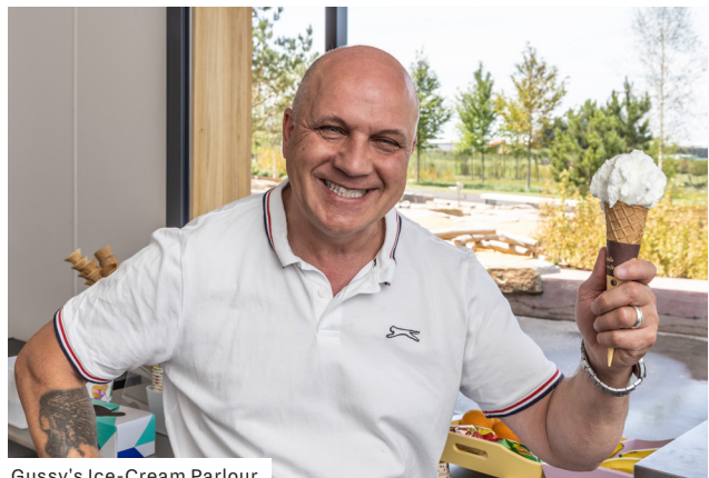
Gussy's Ice-Cream Parlour

Please visit: www.brentcrosstown.co.uk/claremont-park for more information on how to get to Claremont Park.