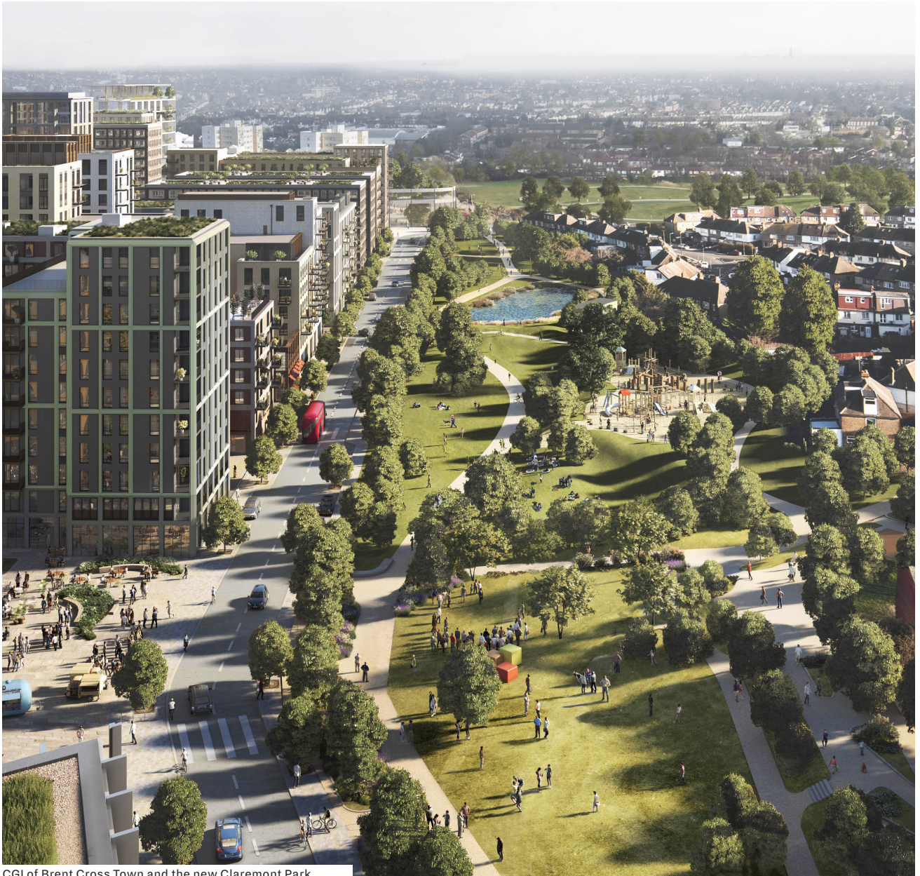
CGI of Brent Cross Town and the new Claremont Park

If you have any questions or feedback, please contact: