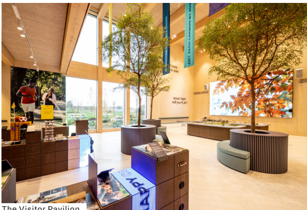
The Visitor Pavilion

Please visit: www.brentcrosstown.co.uk/the-visitor-pavilion for more information on opening times.