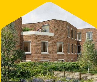
Plots 53 and 54