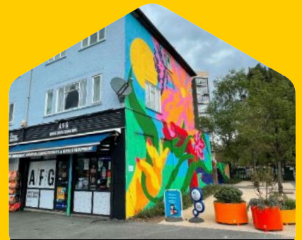
Brent Cross Town