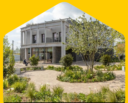
Brent Cross Town