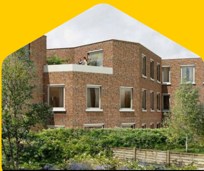
Plots 53 and 54