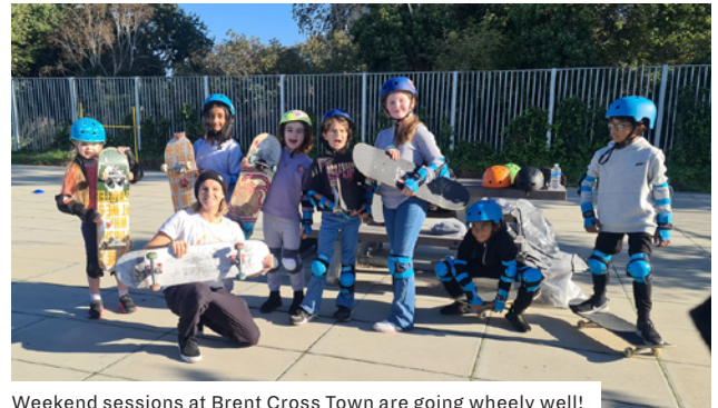
Weekend sessions at Brent Cross Town are going wheely well!

We have previously announced the 11 local organisations that received funding, and this year's winning entrants had a focus on mental and physical health and wellbeing. One of those is the Keep Rolling Project.