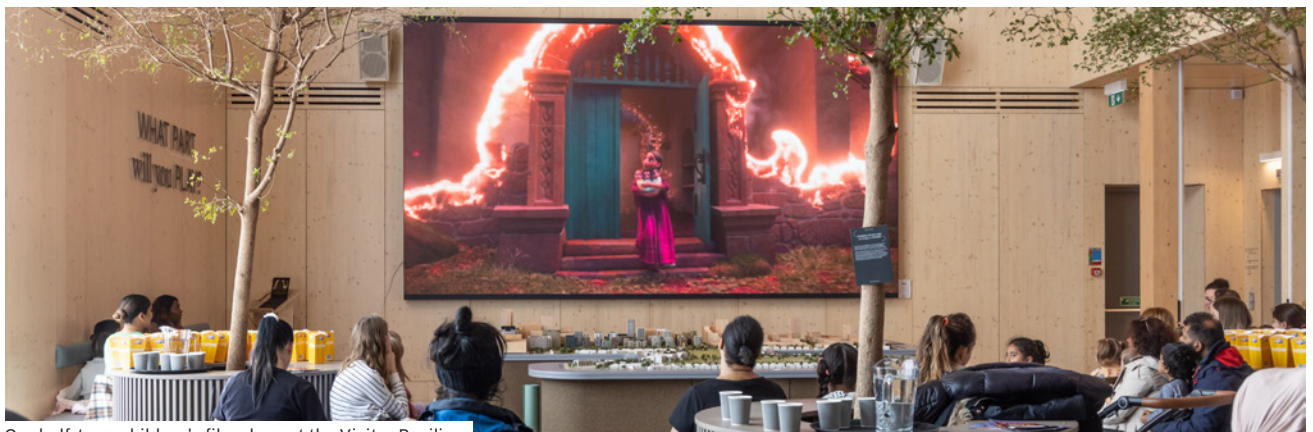
Our half-term children's film show at the Visitor Pavilion