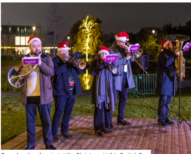
Brass band performing at the Christmas Lights Switch On

And if you’re enjoying a winter walk at Claremont Park, don’t forget to check out Gussy’s Ice Cream , where Gussy will be serving your favourite treats, including soup, mince pies, hot chocolate and marshmallows!