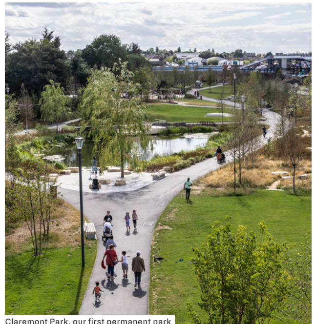
Claremont Park, our first permanent park