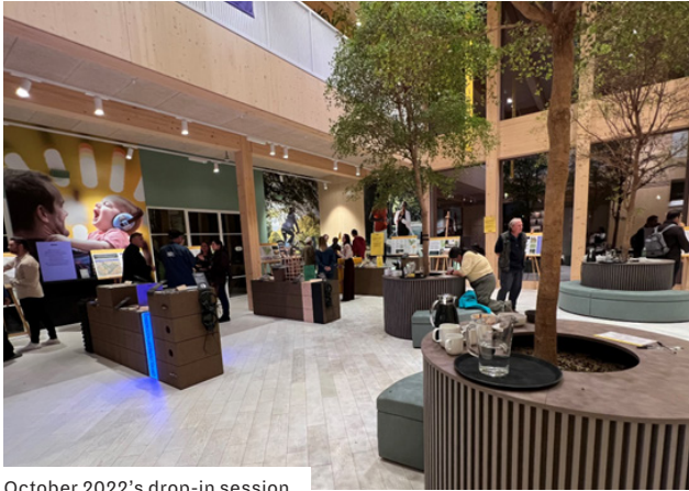
October 2022's drop-in session

Alongside the Brent Cross Cricklewood regeneration team, we have been holding regular community drop-in sessions. These have proved popular with the community, so we're delighted to be extending them into 2023 so that we can continue to hear from you and provide you with the chance to meet the team from Related Argent and Barnet Council, as well as our construction contractors and partners, including L&Q.