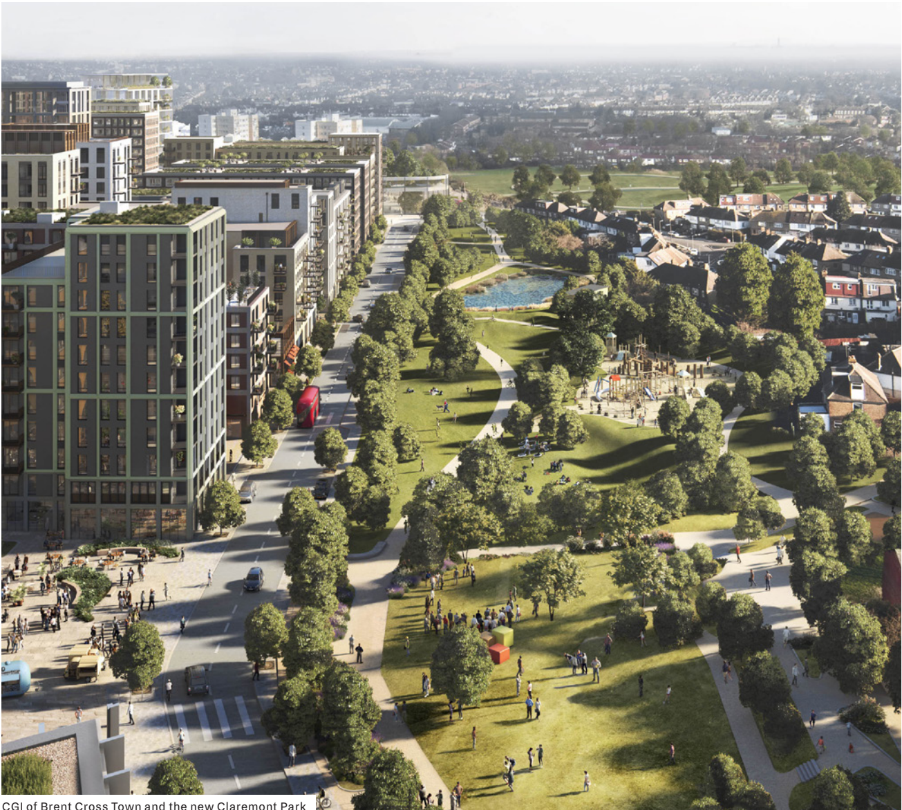
CGI of Brent Cross Town and the new Claremont Park

If you have any questions or feedback, please contact: