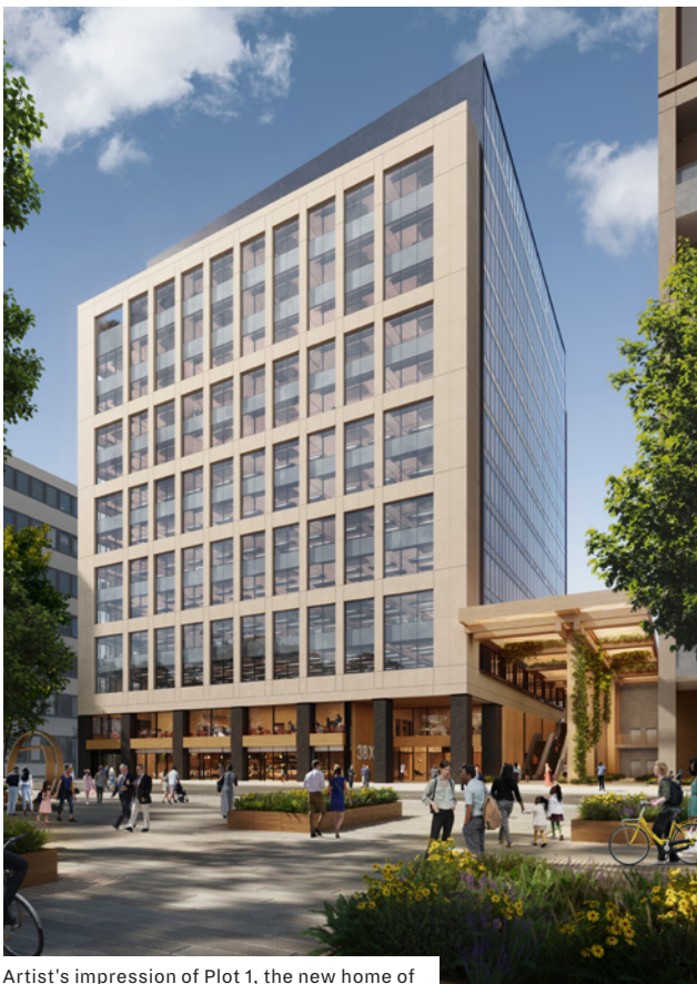
Artist's impression of Plot 1, the new home of Sheffield Hallam University's Satellite Campus

The university is scheduled to open in or for the 2025/26 academic year.