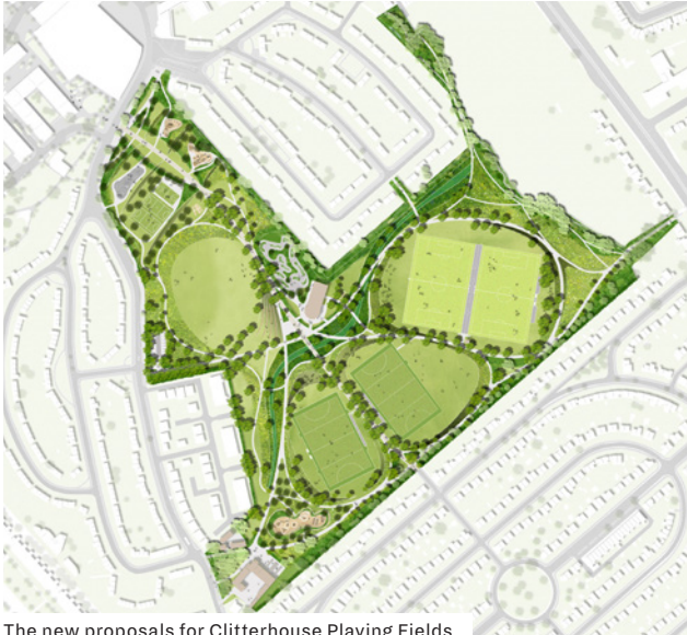
The new proposals for Clitterhouse Playing Fields

Over the last 12 months, we have held three rounds of consultation with the local community regarding our proposals, with nearly 700 people attending our in-person events and over 900 pieces of feedback received.