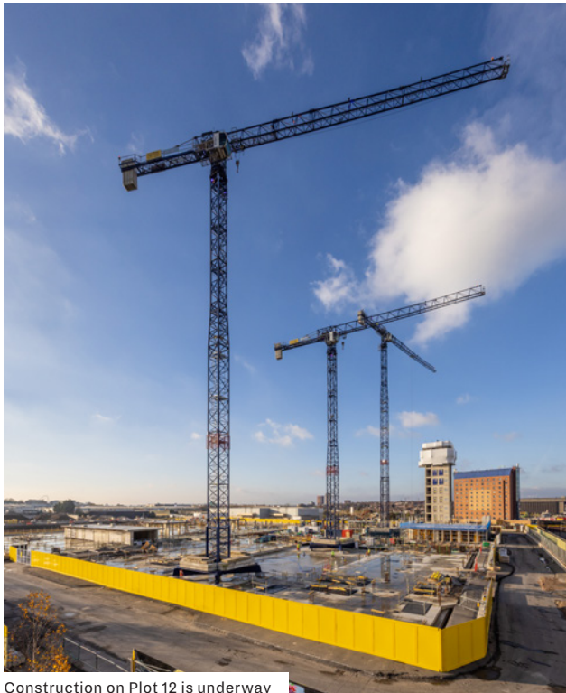
Construction on Plot 12 is underway

For anyone living close to the site, you will have seen that construction is underway on the first buildings at Brent Cross Town.