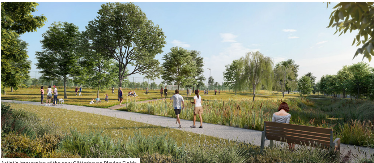
Artist's impression of the new Clitterhouse Playing Fields