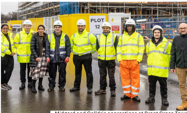
Midgard and Galldris apprentices at Brent Cross Town