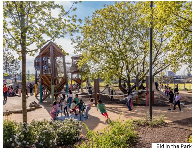
Eid in the Park

We hope all those who celebrated had a peaceful and happy Eid.