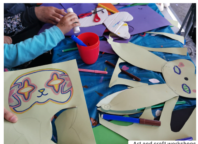
Art and craft workshops