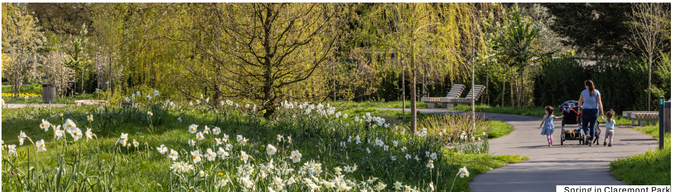
Spring in Claremont Park