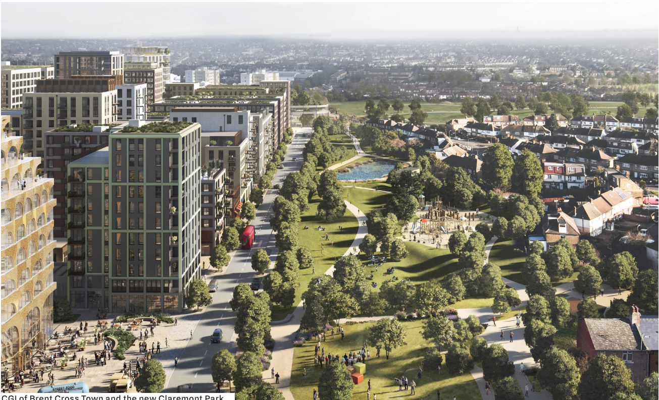
CGI of Brent Cross Town and the new Claremont Park

So please do not hesitate to reach out to us at community@brentcrosstown.co.uk with any feedback or concerns – we look forward to hearing from you!