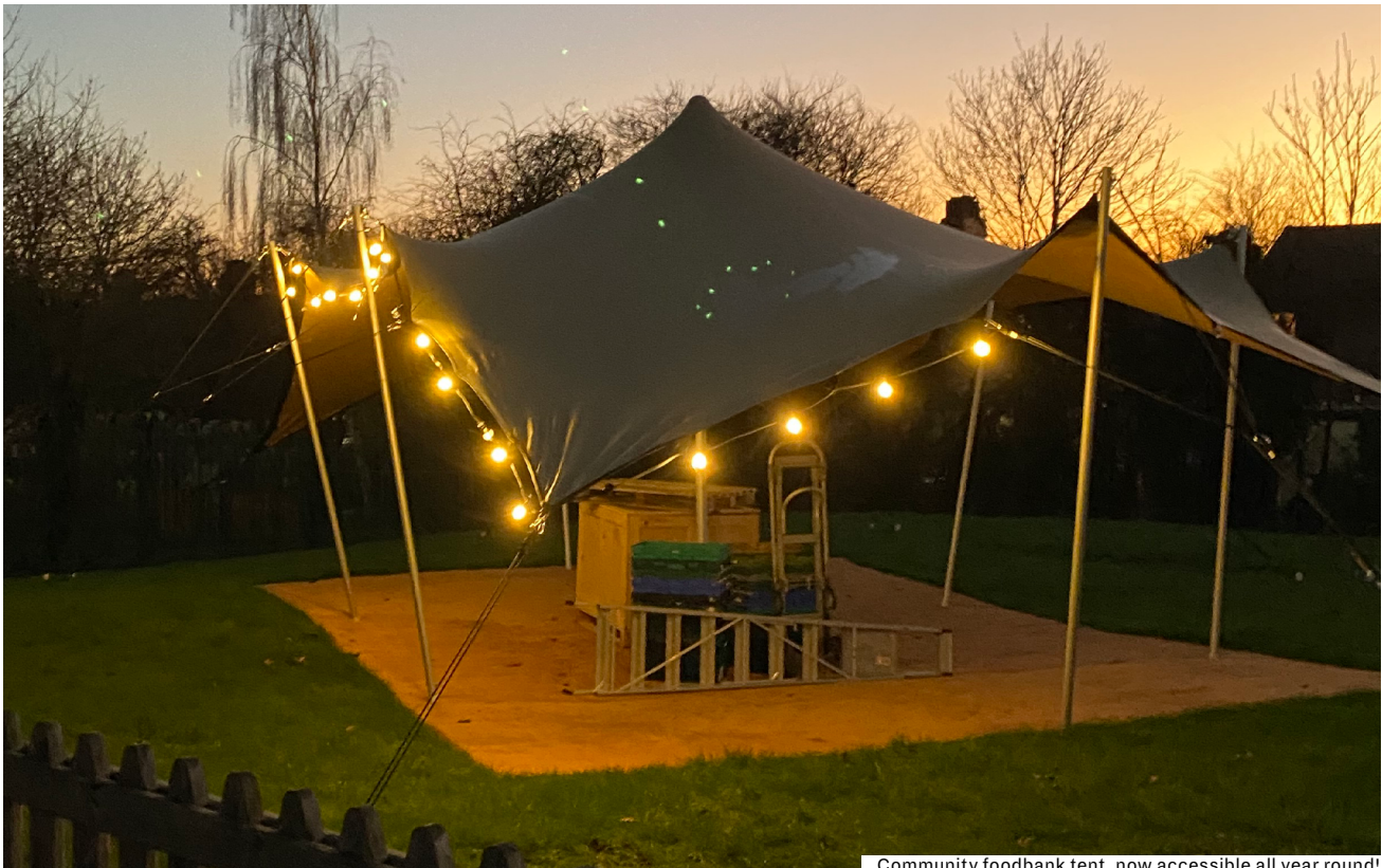
Community foodbank tent, now accessible all year round!

“ Now that the area has been resurfaced. We look forward to using this space even more now in the summer and have sessions outdoors as well as cooking lessons. This will allow children to gain outdoor experience and be in a different learning environment.”