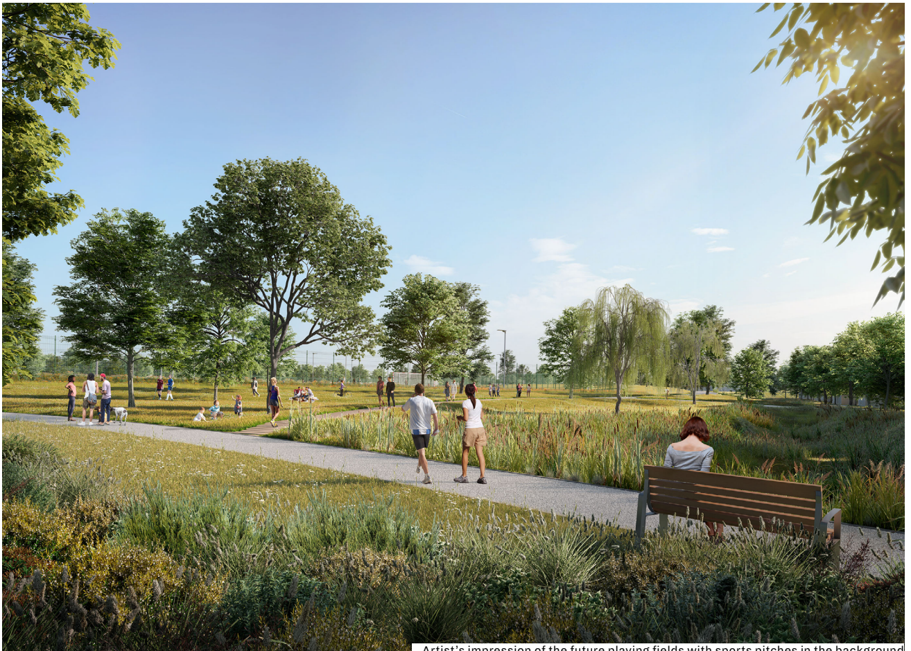
Artist's impression of the future playing fields with sports pitches in the background

To provide the most up-to-date information on our proposals and to answer the questions that have been raised about the proposals, we have produced a Frequently Asked Questions (FAQs) document.