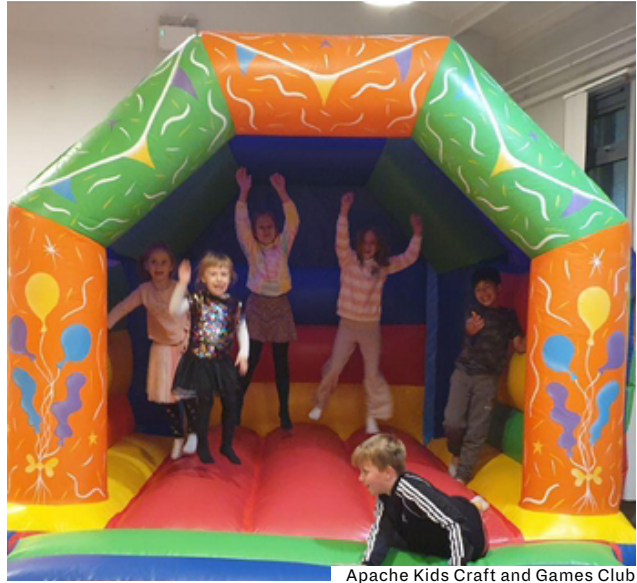
Apache Kids Craft and Games Club

The Apache Kids Club is open on Fridays from 5:30 pm to 7:00 pm. If your child would like to join in on the fun, please feel free to reach out by emailing apachekidsclub@outlook.com or visiting brentcross town.co.uk for more information. Let's come together to create lasting memories for our children and support this amazing community initiative.