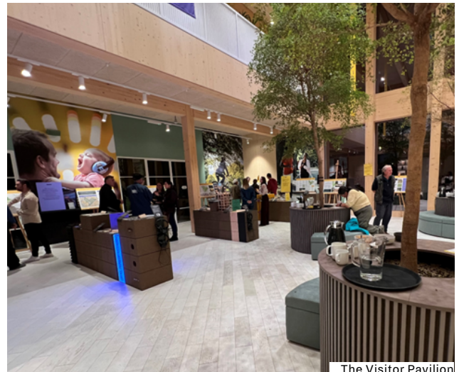
The Visitor Pavilion