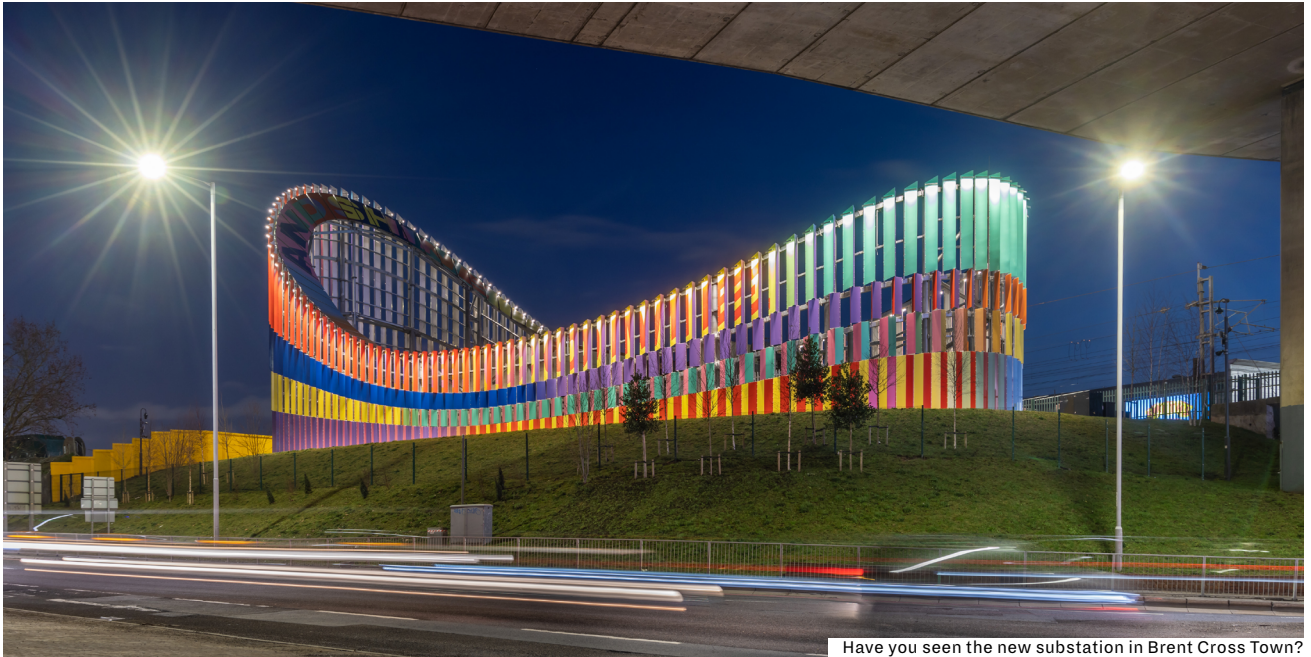
Have you seen the new substation in Brent Cross Town?

This new landmark called “Here we come, here we rise and shine” is the colourful wraparound artwork covering the brand new substation in Brent Cross Town. Created by the talented artist Lakwena Maciver, in collaboration with architects IF_DO, this breath-taking 52-metres long and 21 metres tall structure is located between London North’s Circular Road and the M1 motorway, right next to the new Brent Cross West station.