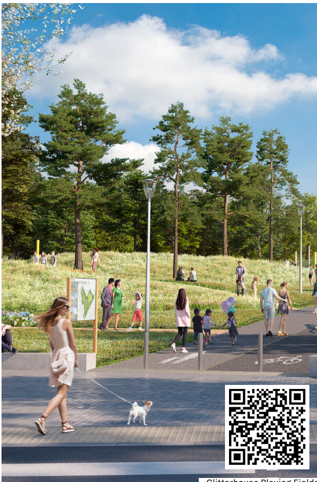
Clitterhouse Playing Fields

Updates and revisions to planning applications are a normal part of the planning process, and we are pleased to have been able to incorporate residents' additional feedback into our updated submission. We are eager through the plans for Clitterhouse Playing Fields to create a space that everyone in the community can enjoy.